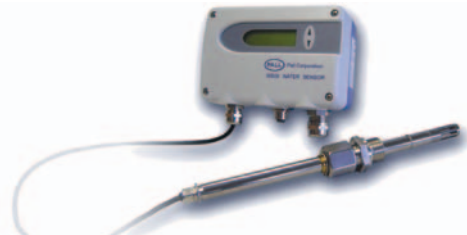
Pall WS08 Water Sensor