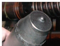
Large Diesel Engine Fuel injector with blocked injector nozzels caused by fuel contamination