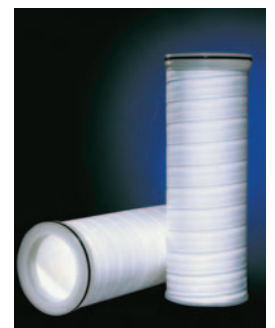
Pall Ultipleat High Flow Elements