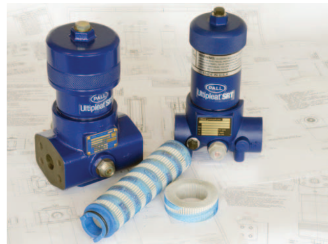
Pall Ultipleat SRT Housing Elements