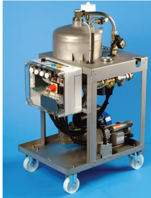
Pall HNP006 Purifier

Specifically designed for harsh industrial environments such as the mining industry, the WS08 Water Sensor features a modular housing concept, “plug-and-play” connectivity, simple on-site adjustment and calibration, and interchangeable sensor options.